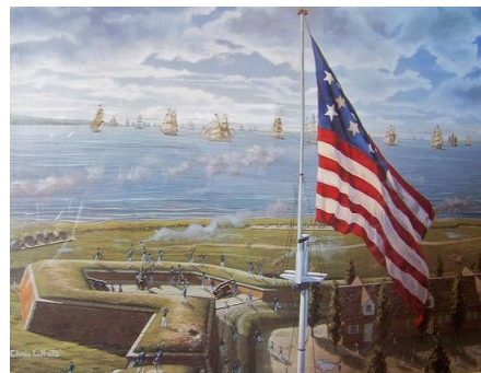
War of 1812 and the Star-Spangled Banner

The Americans unwillingness to be defeated during the bombardment of the Baltimore harbor, and the resilience of the American flag, inspired Francis Scott Key to write the poem "Defence of Fort M'Henry." His poem would later become the lyrics for the U.S. National Anthem.