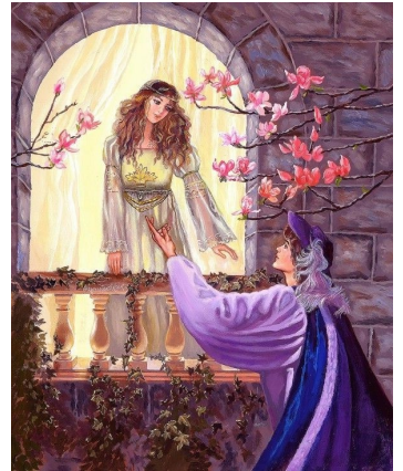
Romeo and Juliet Balcony Scene