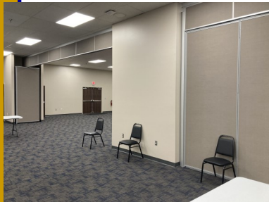
Early Voting room with new partition walls installed.