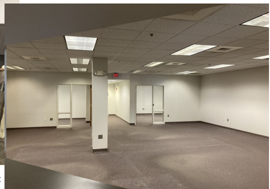
"Goodbye, old friend!" The cleaned out old office at 35 W. Washington Street.