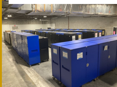
The sea of precinct and ballot transfer carts in the new warehouse.