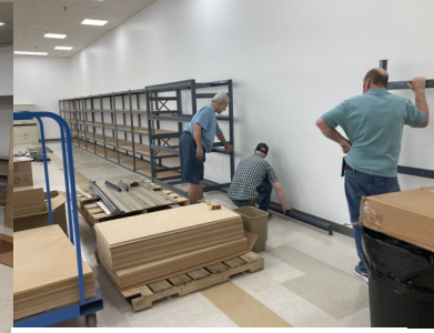
Installing shelves in the Election Judge supply area.