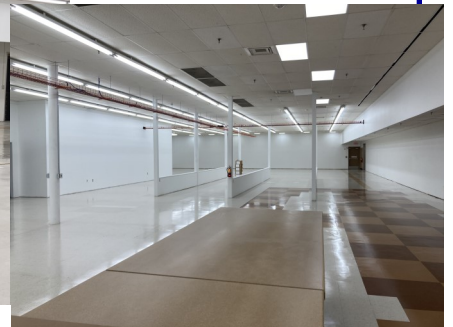
Finished product: waxed floors in work area.