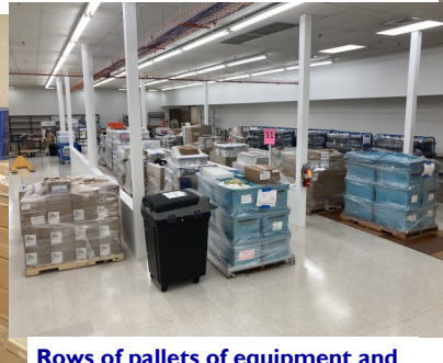
Rows of pallets of equipment and supplies.