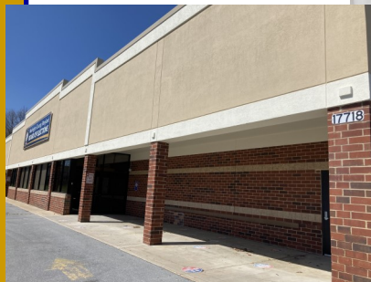
Front of building with street number installed.

We hope to have an open house in the summertime, once we're completely moved in and COVID restrictions are eased (fingers crossed!) We'll keep you posted. In the meantime, here are some images from the days leading up to the move.