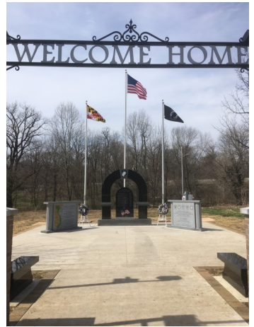
The Vietnam Memorial near City Park.